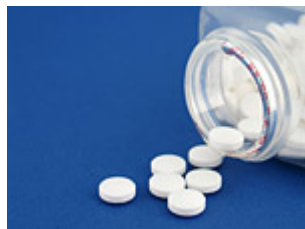
An Aspirin Please

Aspirin is a drug that keeps giving. A new study shows aspirin helps to enable adult stem cells form new bone. Discover how: